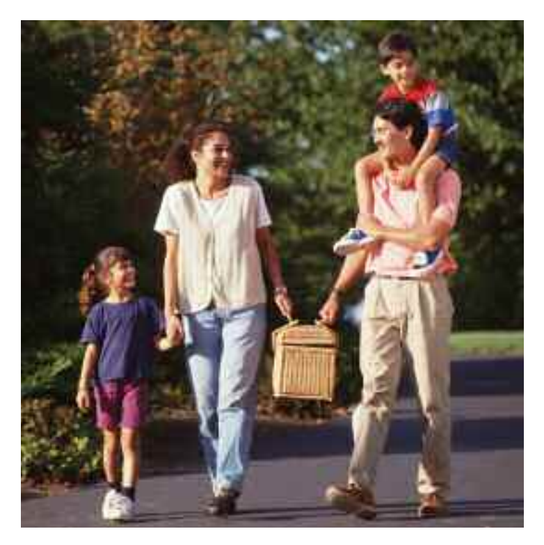
Complete Plan Information will be available for mailing January 1, 2007

USBA will be launching its new 10-Year Level Term plan on January 1, 2007. "We're very proud to offer this product which has been a long time in development because we were focused on getting the most attractive rates possible for members," says