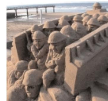
A sand sculpture representing soldiers landing on a beach sits in Vierville-sur-mer, which was known as Omaha beach on D-Day.

In the world of e-mail, we've come to accept that pictures and stories can be faked, mismatched or misunderstood. Perhaps you have seen these photos which commemorate soldiers' sacrifices during wartime and were skeptical? Here's the scoop: