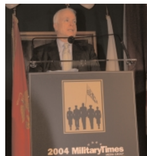
Senator John McCain makes opening remarks at recent awards presentation.